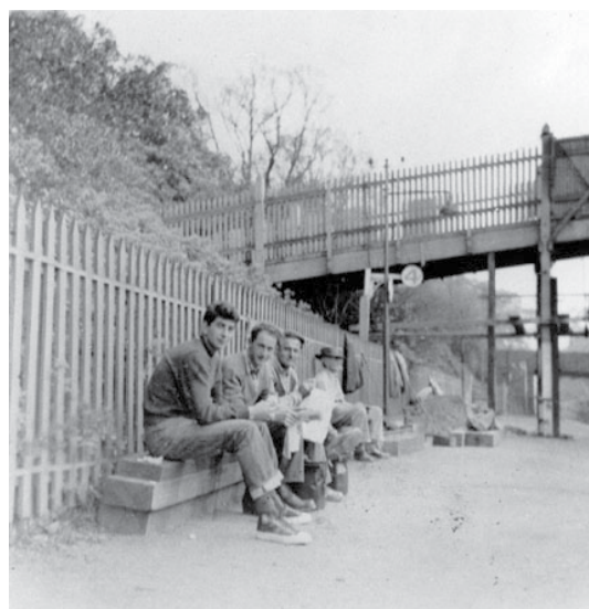
Operai italiani – Jolimont Station – 1956