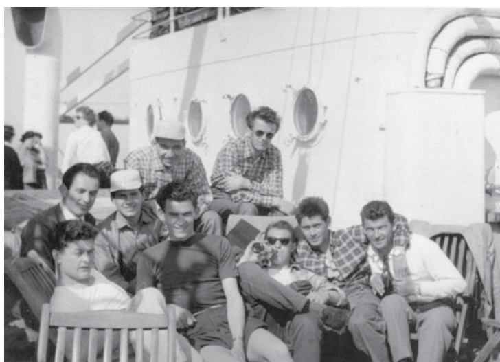
Travelling to Australia – May 1955