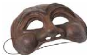
Commedia dell'Arte mask